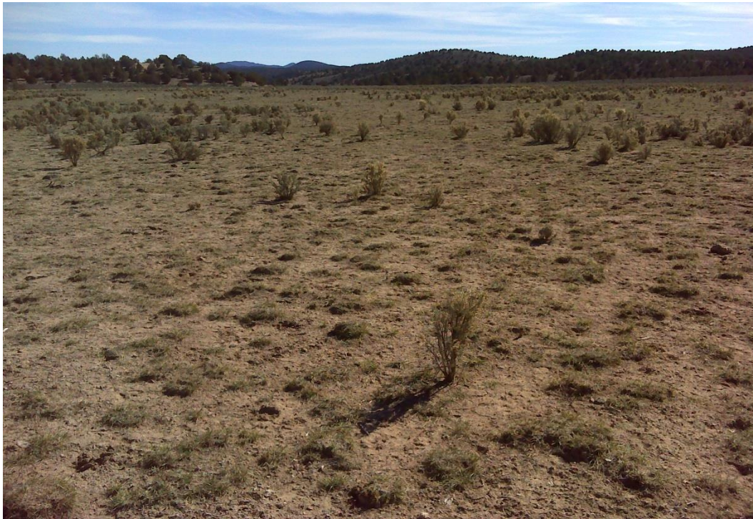
Miller Flat (2015)

The only water available for wild horse use is provided by springs which have seasonal and marginal flow. Limited riparian habitat and their associated plant species occur in association with the springs.