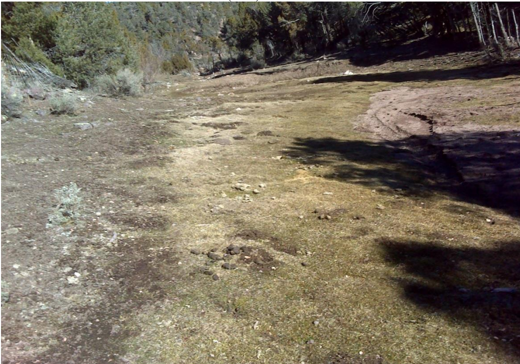
Ella Spring (2015)