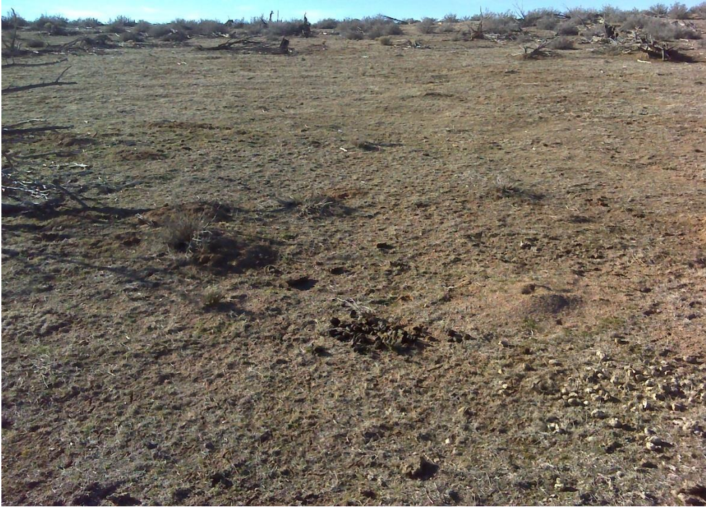
Crestline Burn Little Mtn HMA. (2015)