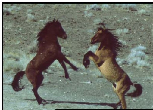
Wild horse stallions defending their territories

WHB-3: Contiguous HMAs with documented reproductive interaction will be managed as complexes to enable better management of genetic traits for the population and to improve coordination of monitoring and gathering.