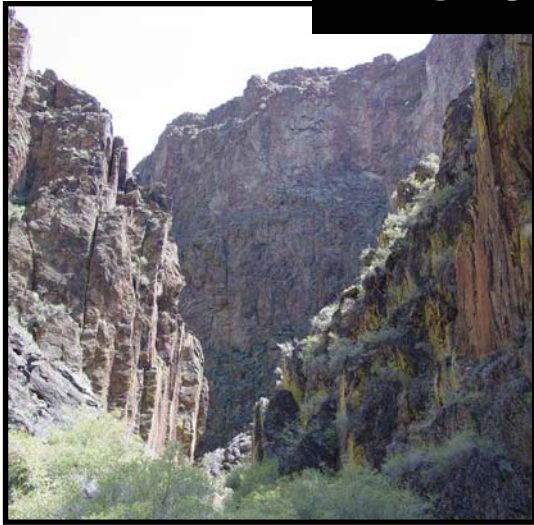
Mahogany Canyon in the High Rock Canyon Wilderness