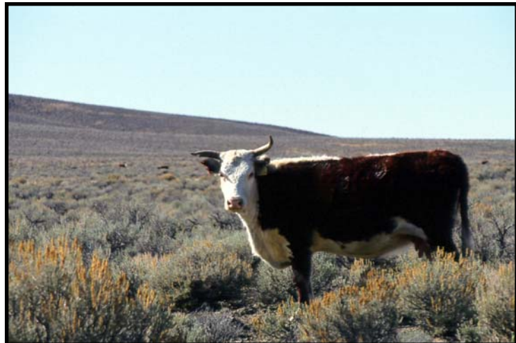
Hereford cow on Rangeland

GRAZ-6: Existing authorized structural rangeland projects will be maintained where beneficial to resource values. New rangeland projects may be developed when consistent with achieving Land Health Standards and the objectives of the plan. Projects no longer needed to meet livestock and other resource management objectives will be removed and the sites restored.