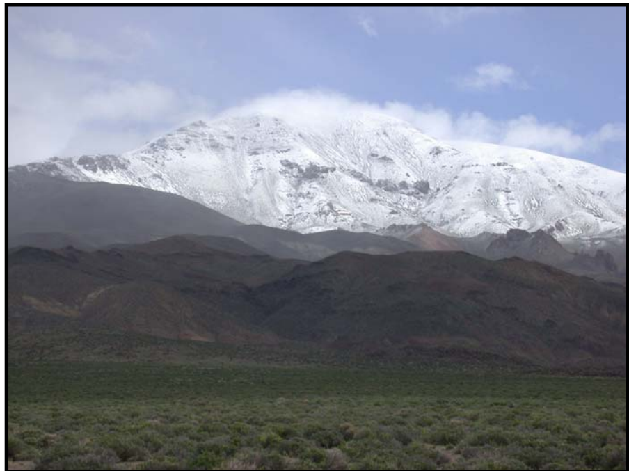
Spring snowstorm in the Pahute Peak Wilderness

AIR-2: Site-specific project proposals affecting BLM and adjacent lands will be reviewed for compliance with existing air quality laws and policies. Mitigation will be incorporated into project proposals to reduce air quality degradation. Projects will be designed to minimize further degradation of existing air quality.