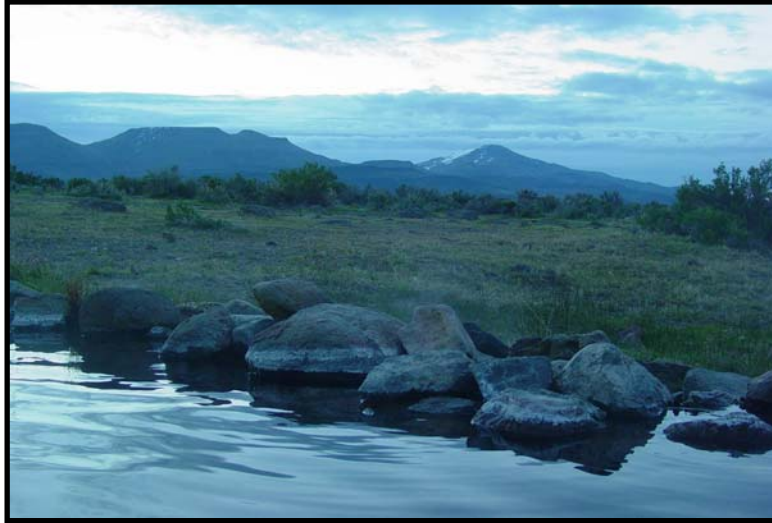
View from Soldier Meadows hot spring pool

Standards are achieved through the use of guidelines developed for specific programs and uses. Because the Standards were originally applied to livestock grazing, guidelines for livestock grazing (Appendix B) will continue to apply to that use. Guidelines for other uses and programs will be implemented as part of the adaptive management process (see Chapter 3). Currently existing guidelines for resources and programs will be incorporated during RMP implementation and new guidelines will be developed where none exist. The participation of the public, State, Tribal and local governments, and other federal agencies will be used during the adoption and development of guidelines.