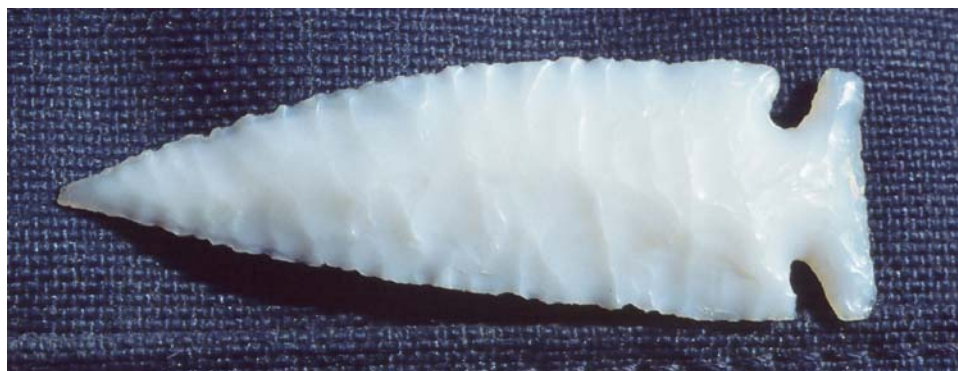
Native American Projectile Point

Note: A comprehensive overview and research design will be developed for the planning area to guide future inventories, eligibility evaluations, research needs, and other management decisions. Outstanding eligible resources identified and recorded as a result of inventories may be nominated to the National Register of Historic Places.