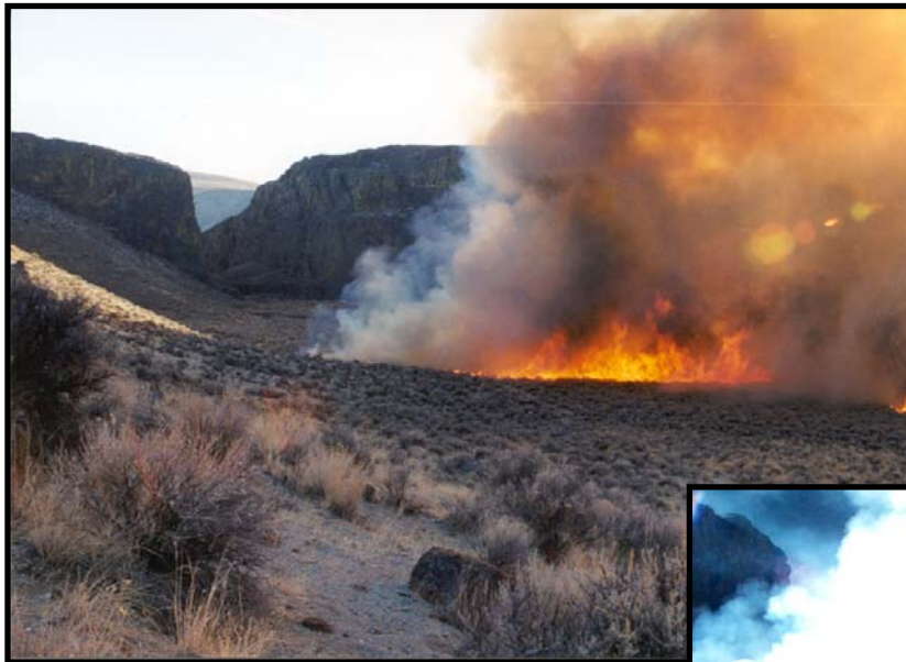
Prescribed burn in High Rock Canyon

Updating the current Fire Management Plans (FMP) will be a priority during the first year of RMP implementation. FMPs are used to guide wildland fire suppression, fuels management and other aspects of fire management. These plans will be periodically evaluated and updated based on changes in technology, policy, scientific knowledge, and other factors in a manner consistent with the purposes for which the planning area is managed. FMPs will provide appropriate fire suppression resources in or near the planning area for initial attack consistent with resource objectives.