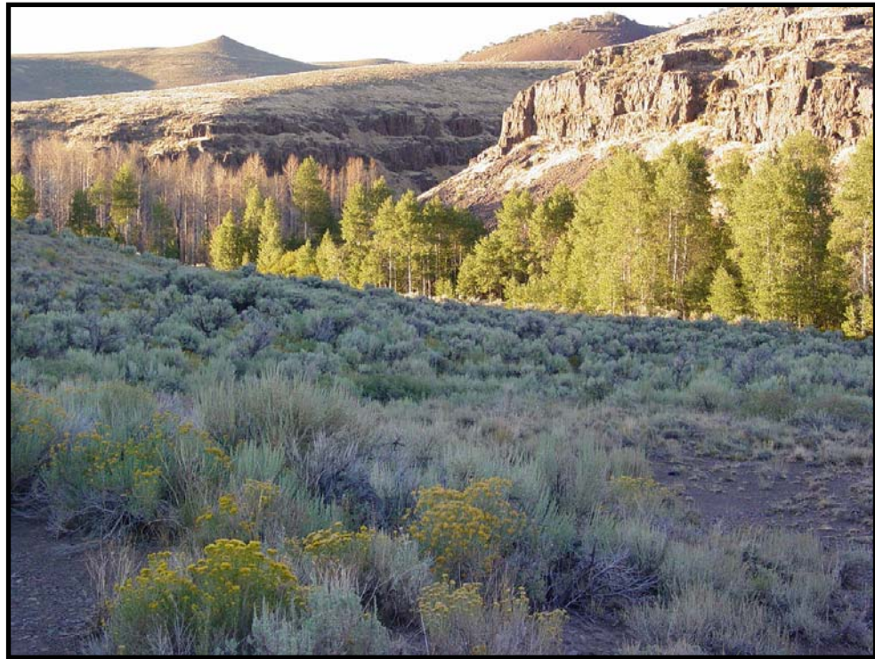
Aspen, sage, and rabbitbrush in the Lahontan Cutthroat Trout WSA

Note: After completion of the RMP, preparation of a Wilderness Management Plan (WMP) is a priority. During BLM's preparation of the WMP interested publics and agencies will be provided opportunities to participate in and supply input to the planning process. The WMP will contain specific objectives, and outline management actions and monitoring procedures by which the objectives will be accomplished. The WMP will establish the type and level of environmental assessment necessary, including “minimum requirement and minimum tool analyses” for all site-specific management actions.