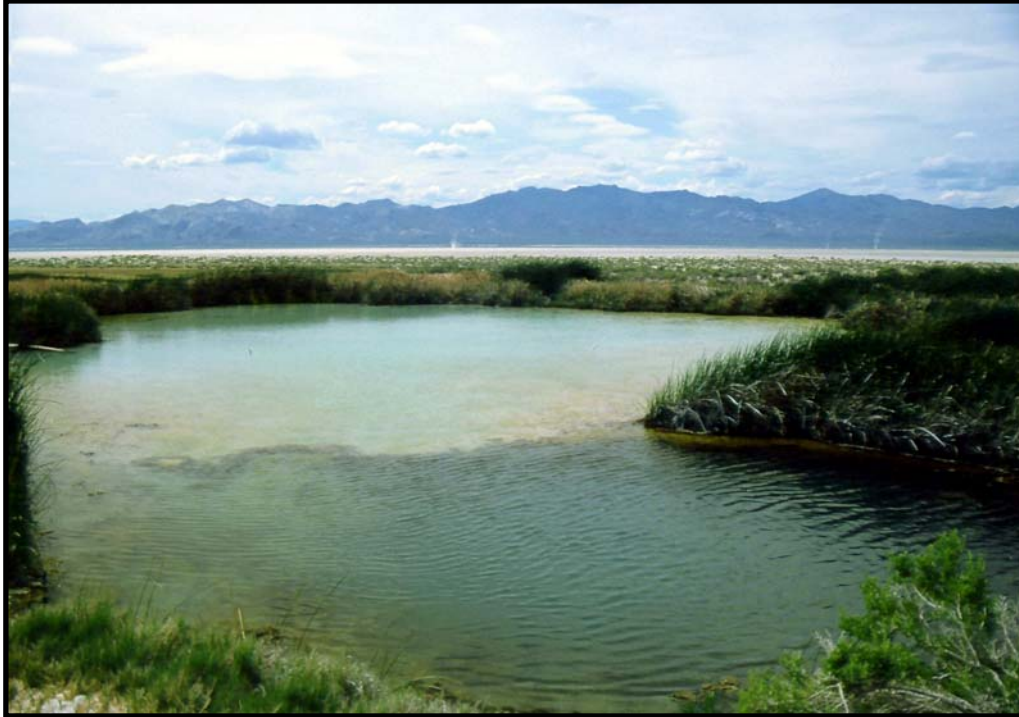
Black Rock Hot Spring with Calico Range in Background

WATER-4: BLM will file for water rights with the State of Nevada to support uses consistent with the intent of the NCA Act that help to achieve resource management objectives and maintain healthy and functioning riparian and upland systems.