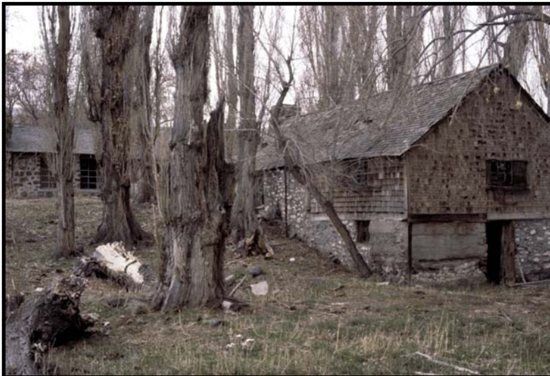
Part of historic Camp McGarry on the Soldier Meadows Ranch