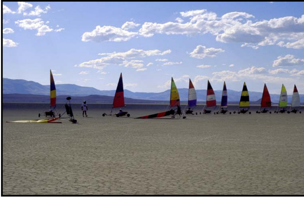
Land Sailors on the Black Rock Playa

REC-28: Rocket launching activities would be required to use the rocket launching area (12,499 acres) indicated on Map 2-15, unless otherwise approved for public safety, resource concerns, or due to specific operating requirements.