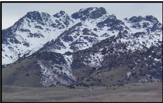
The east face of King Lear Peak in the South Jackson Mountains Wilderness