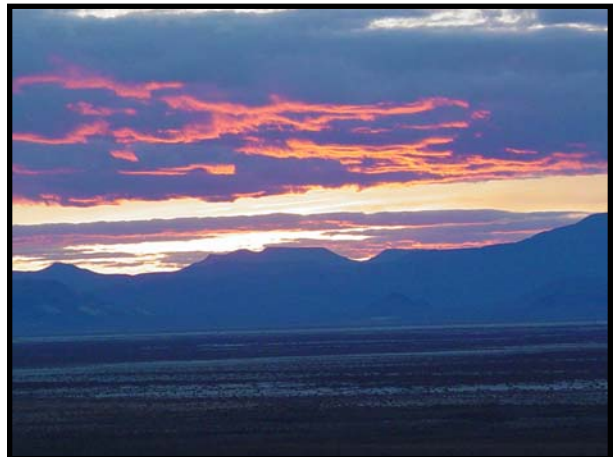
Sunset across the Black Rock Desert Wilderness