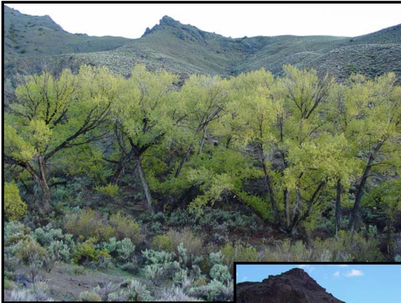
Springtime cottonwoods along the boundary of the South Jackson Mountains Wilderness

LCT Area-4: If monitoring indicates that impacts are occurring to the spawning habitat of the Lahontan Cutthroat Trout, appropriate motor vehicle restrictions will be implemented in the LCT Area. These restrictions may be seasonal or permanent closures of trails. Where practicable, BLM will also construct hardened stream crossings where motorized trails cross streams in the LCT Area.