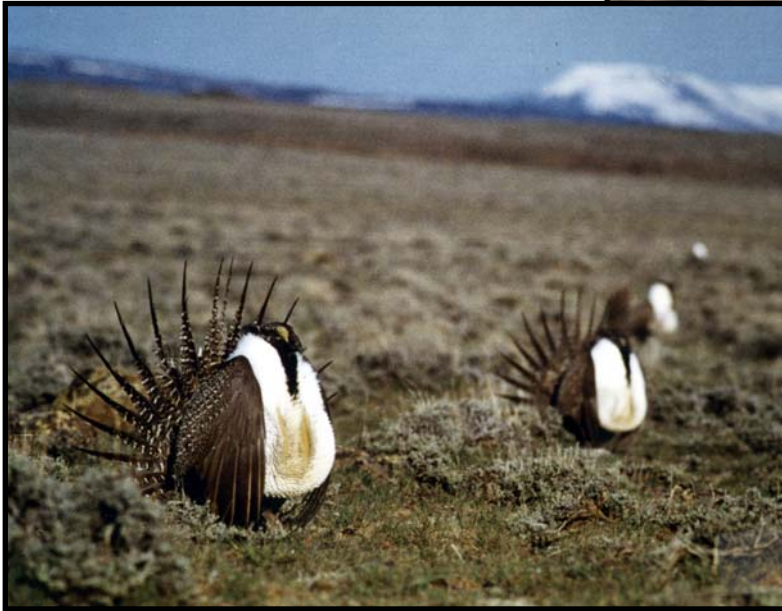
Strutting male sage-grouse