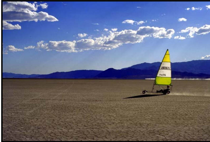
Land Sailor on Black Rock Playa

Note: Standards would be established for the Front Country, Rustic, and Wilderness Zones. Tolerance for group activities and encounters would generally be very low in the Wilderness Zone and highest in the Front Country Zone.