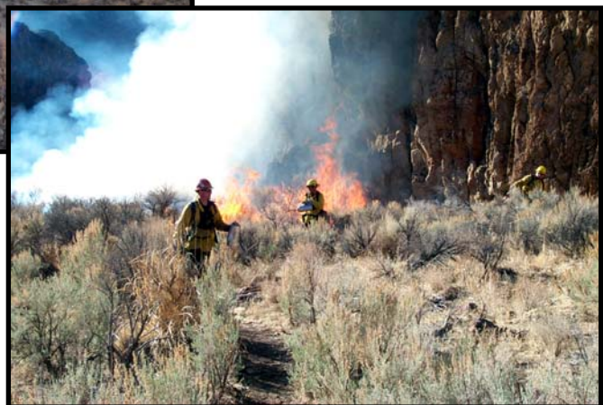
Prescribed burn in Little High Rock Canyon