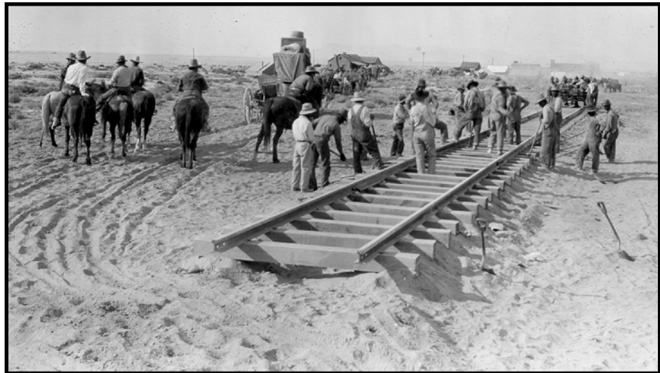
Construction of railroad siding to the 1926 “Winning of Barbara Worth” movie set

LAND-9: Land use permits may be issued consistent with the guidelines for special recreation permits (see Section 2.20.2).