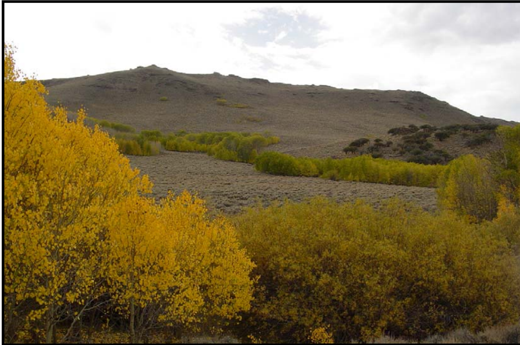
Autumn colors in the Lahontan Cutthroat Trout WSA