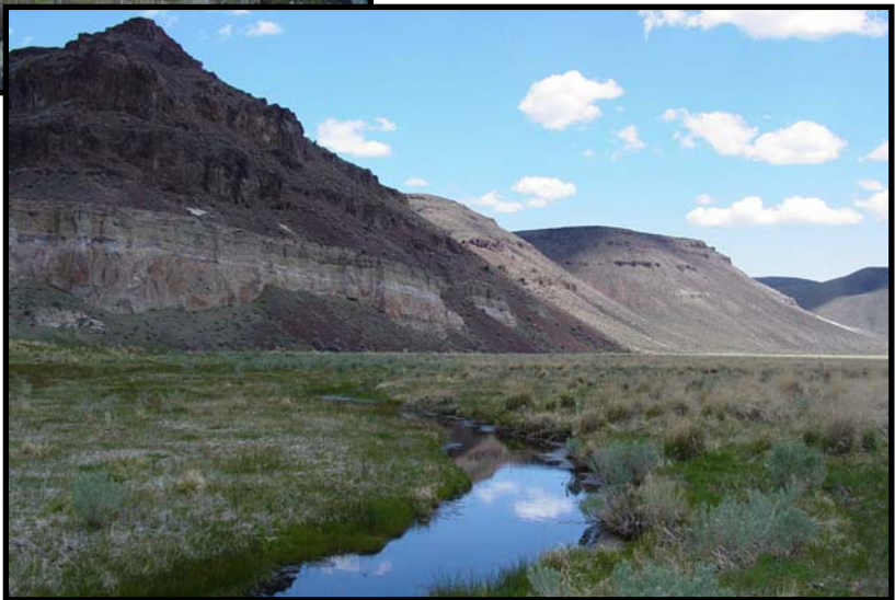
Canyon walls reflected in the East Fork of High Rock Canyon Wilderness