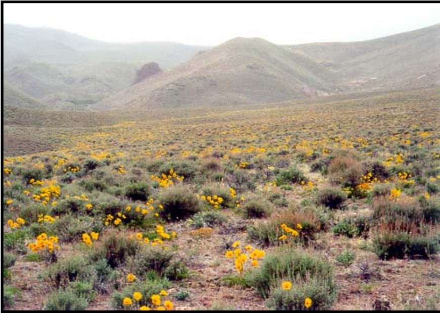
Balsam root flowering in the High Rock area