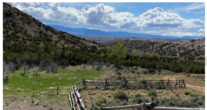
Figure 11: Layout Creek, with the PMWHR to the right of the fence line and land excluded from grazing on the left.

cottonwood, and conifers with a limited diversity of riparian obligate herbaceous species. It is very well armored with rock and cobble. A portion of the stream and riparian area is within a deep gorge or very rocky canyon that is inaccessible to wild horses while the portion outside of the natural barrier has been incorporated into an exclosure. Impacts to the riparian area from wild horses using the stream for a water source are minimal due to the lack of favorable forage and limited accessibility. BLM assesses Layout Creek in 2021 and found it to be PFC in the upper reach and FAR with an upward trend in the lower reach (exclosure).