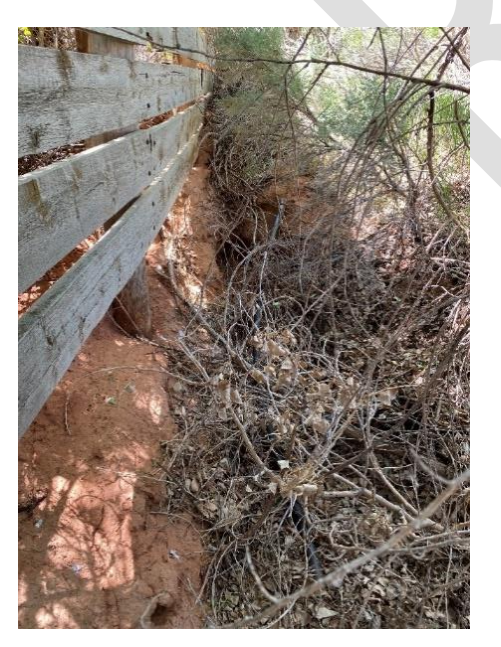
Figure 14: Incised channel forming near exclosure fence at Sykes Spring.

The pattern of overland flow would continue, which is currently resulting in a headcut and formation of an incised trench along the exclosure fence. If continued unabated, this channel formation could undermine the stability of the exclosure fence over time.