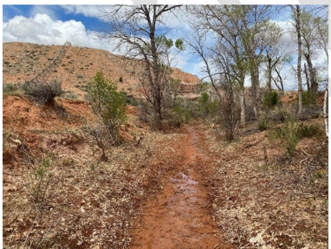
Figure 10: Cottonwood Spring

Cottonwood Spring: Cottonwood Spring is a lentic riparian system at approximately 0.12 acres. The BLM determined that this site is Functioning at Risk (FAR), primarily due to limited age distribution of cottonwood trees and willows as well as high levels of salts accumulating in the soil. The lack of herbaceous obligate species was noted by the BLM at the site, which could be attributed to the high mineral content and overuse by wild horses (historic and current).