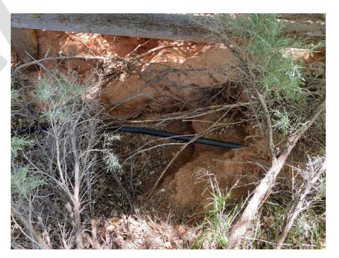
Figure 15: Incised channel forming near exclosure fence at Sykes Spring is exposing pipe infrastructure that was installed to convey water down spring.