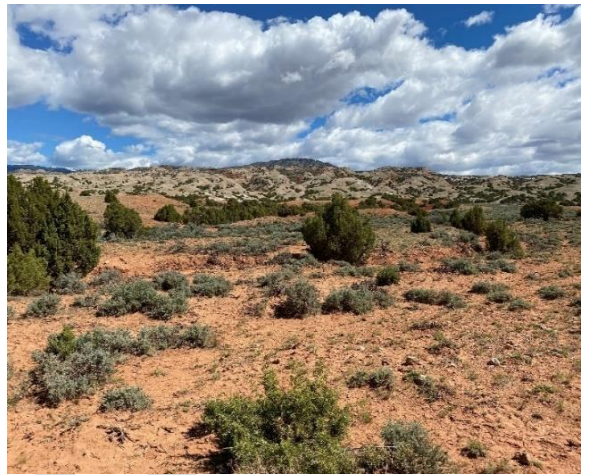
Figure 3: Low elevation desert on the PMWHR (winter range)