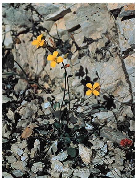
Figure 16: Pryor Mountains Bladderpod (Lesquerella lesicii)