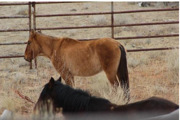
Figure 6: Seneca on 3/2/22; Henneke Body Condition 3