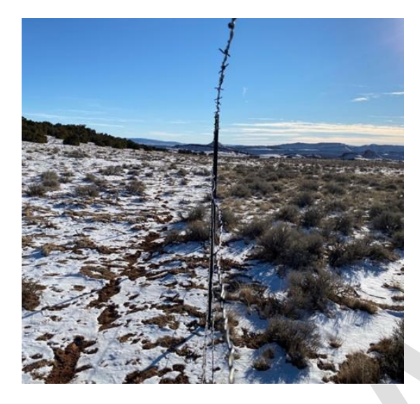
Figure 9: Turkey Flats, January 3, 2022. The area to the right of the fence lies within a long-term grazing exclosure, and the area to the left is grazed by the Pryor Mountain horses.

The BLM estimated only 8.3 pounds per acre of residual forage in November 2021 (sufficient to feed 8 horses for one month at 50 percent utilization). The low production values may be attributed to long-term, sustained early spring grazing, and year-round grazing combined with drought conditions in 2021. Additionally, RAP data suggests that the amount of bare ground has decreased over time, while the amount of tree cover has increased. Perennial forb and grass are pretty consistently between 10 - 20 percent, indicating that graminoids have been below the range for the ESD for at least the last 30 plus years.