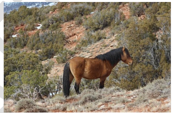
Figure 7: Horizon on 3/1/22, Henneke Body Condition 4

Population Management: This analysis focuses on how differences in gather objectives and fertility control treatments proposed under each alternative would affect population trends and body condition/health. Currently, the BLM and NPS annually administer ZonaStat-H (PZP) to the Pryor Mountain mares through remote field darting following decisions made in the 2015 Fertility Control EA. In 2009, the BLM also treated 40 gathered mares with PZP-22. The BLM has not administered GonaCon-Equine (GnRH Vaccine) or other forms of fertility control to the Pryor Mountain horses.