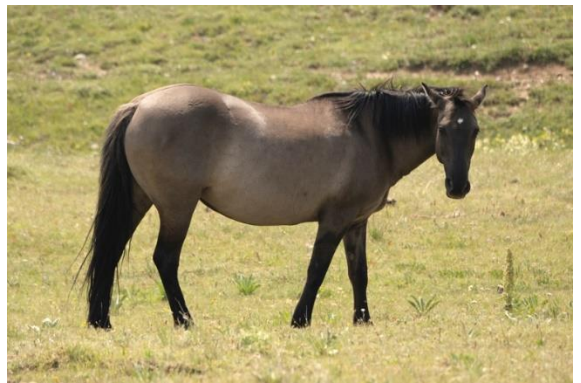
Figure 4: Graciana on 7/26/21, Henneke Body Condition 5