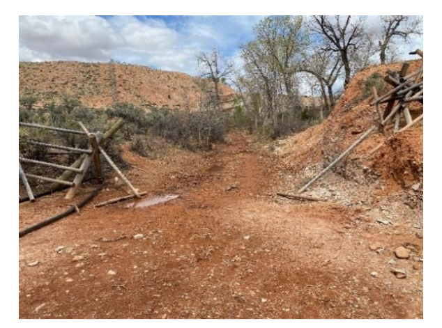
Figure 12: Disconnected hose and vandalized fence at the entrance to Cottonwood Spring