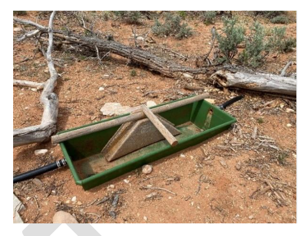
Figure 13: Dry trough, disconnected from the spring

Sykes Spring: Under Alternatives 1 and 4 the existing fence exclosure and spring development infrastructure would be maintained in its current condition. Sykes Spring was dry when the BLM completed the site assessment in the summer of 2021 likely due to extreme drought conditions. However, the current configuration of the overflow pipe may be contributing to the drainage of the groundwater well. The BLM would continue to assess Sykes Spring for riparian functionality and availability of water for horses but would not redesign the infrastructure. The existing development could provide water for horses should the water table rise in subsequent years, albeit a non-reliable water source.