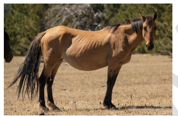
Figure 5:Hataalii on 8/30/21. Henneke Body Condition 2/3