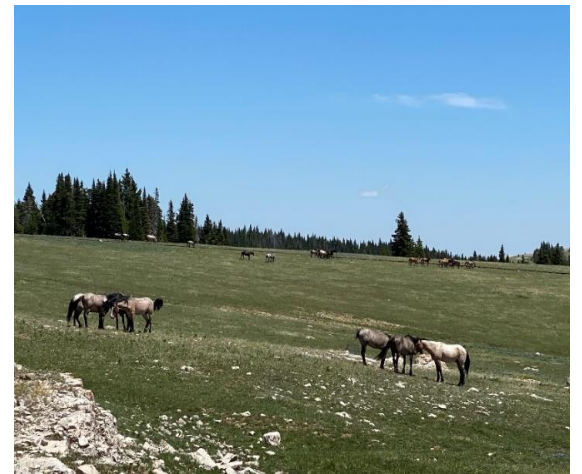
Figure 2: High elevation alpine meadow on the PMWHR (summer range)