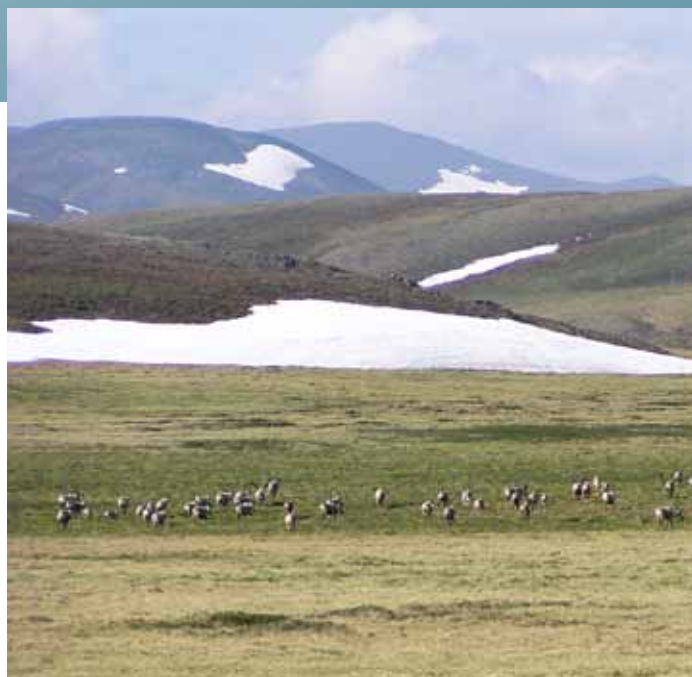
The Western Arctic Caribou Herd calves in the foothills of the Brooks Range in southern NPR-A.

Caribou. The southern NPR-A includes important calving and summer range for the Western Arctic Caribou Herd. The Teshekpuk Caribou Herd normally calves in the northeastern part of NPR-A and migrates the rest of the year through other parts of the NPR-A. How can oil and gas exploration/development and other activities be managed to have the least possible impact on these caribou herds?