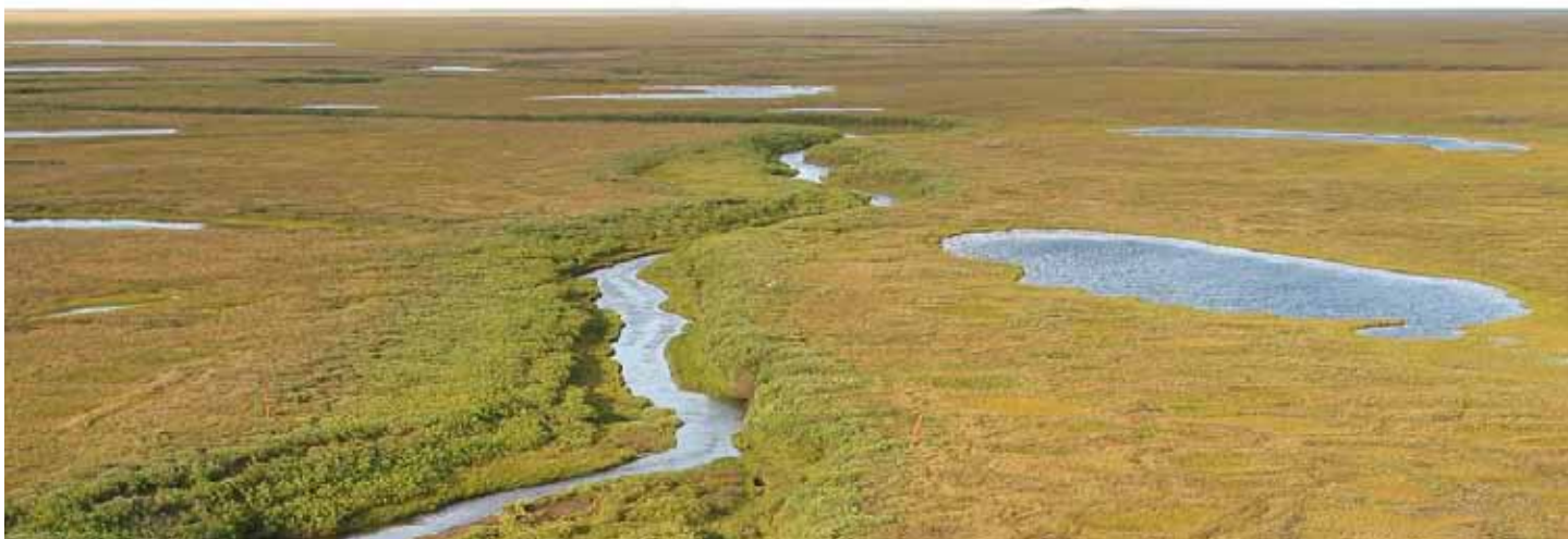
A stream meanders through northeastern NPR-A.